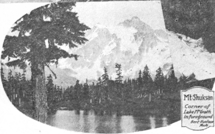
Mt Shuksan Corner of Lake 17' South in foreground Here's another Peak