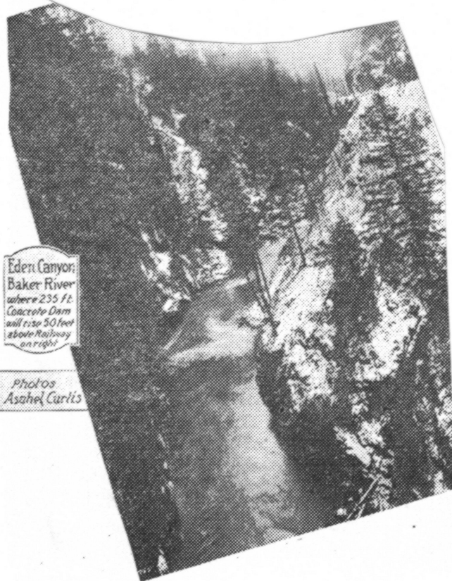
Eden Canyon, Baker River where 235 ft. Concrete Dam will rise 50 feet above Railway on right

Next on the program of the Puget Sound Power & Light company after the announced development on Baker river probably will be the installation of a hydro-electric plant at Sulphur canyon almost as large as that near Concrete. The waters of the Baker river will then be utilized in two steps, the Sulphur canyon site having not quite the same amount of water available due to the fact that two or three tributaries flow into the Baker river between the two.