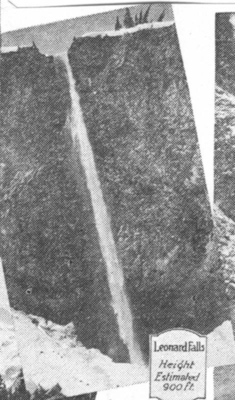
Leonard Falls Height Estimated 900 ft.